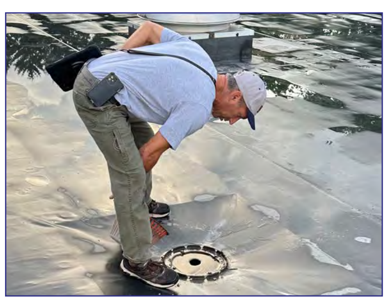
The warranty inspector observing a new drain in action just after a large rainfall

In contemplating the events of the last several months, a question emerged among donors and the RCS and RCSF Boards. The question was, "How do we ensure that we are better prepared for future capital projects?" The reality is that undesignated reserves within the school get used to close the gap between the tuition revenues and the true cost to educate. The school operating budget is very tight each year and historically, capital reserves written into an annual RCS budget are either very small or non-existent. As the building continues to age, we know that mission critical systems have a somewhat predictable and defined useful life. Without proper planning to fund and replace these systems, the school will face this type of urgent need in the future. Clearly, there is an opportunity to recognize this fact and put some measures in place to plan for upcoming capital projects.