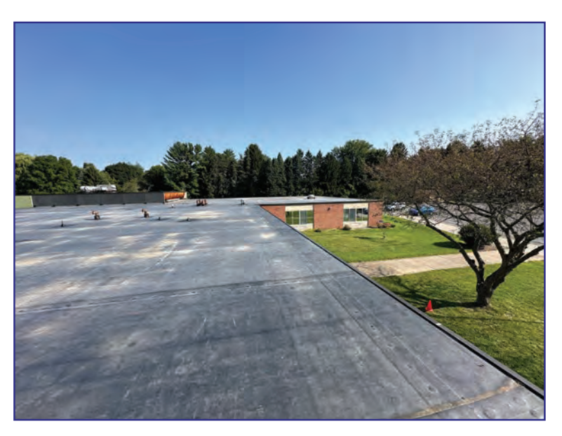
A view of the completed new roof

Over the last 4 months, the response from the combined RCS and RCSF communities has been nothing short of miraculous. Donations of all sizes have come in with a timing that seemed to pattern the need. The man who owns the roofing company was sympathetic to the situation and donated time and materials to help combat some of the unexpected costs that were uncovered as the layers of old roof were peeled away. It became clear to all involved that God was at work in this seemingly insurmountable challenge. As we share this story with you now, we are pleased to report that the new roof is in place and the cost of the project has been almost completely covered. Praise God for his continued faithfulness to RCS!